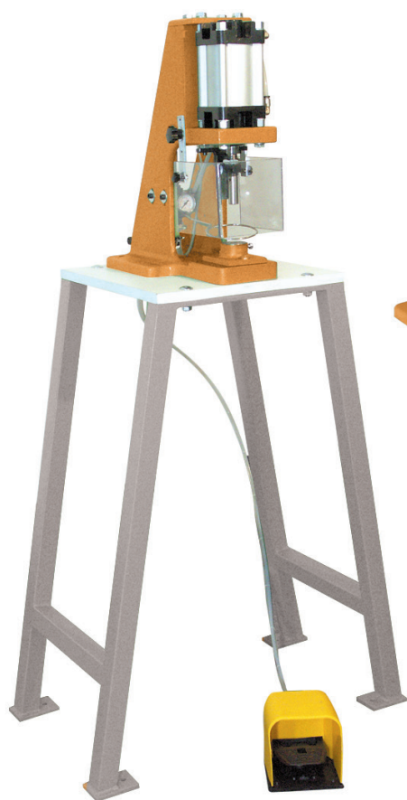
modello M 4/B