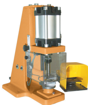
modello M 4